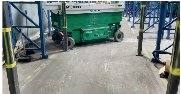
Safety First: Clearly marked temporary columns.