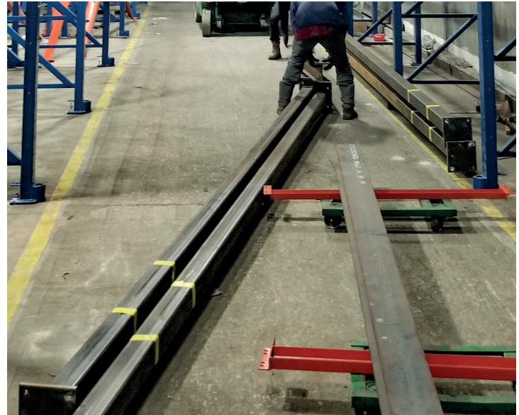
Temporary columns support ceiling while rack is dismantled & replaced row by row.

Decades of successful project completions and collaborations led to choosing E-Distribution for this project... knowing they would deliver the results on this challenging renovation. The E-Distribution team is experienced, knowledgeable and known for creative solutions that get positive ROI results.